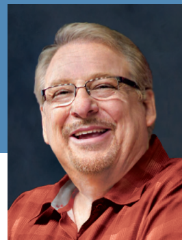
An Invitation From Pastor Rick

Only the body of Christ can show people the way of Christ. We must challenge everyone to be an ambassador for Christ, wherever they are. One drop of water doesn’t make a difference, but a million drops of water can turn a desert into a garden. To accomplish this, we must not neglect the power of individual followers of Jesus Christ.